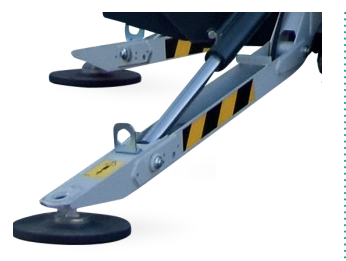
FAST & SECURE LEVELING Automatic outrigger leveling system for quick set up and peace