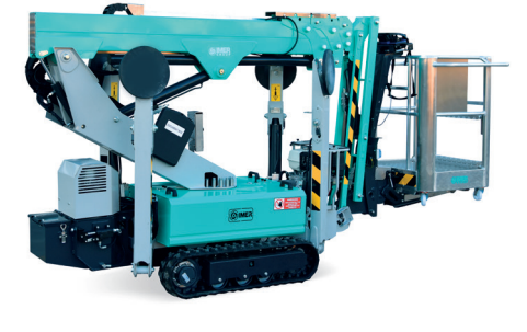
Easy access both outdoor and indoor. Non-marking tracks for indoor use