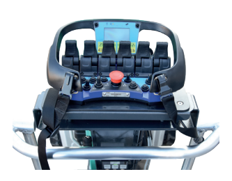
EASY USER EXPERIENCE A user-friendly control panel, easily removable wireless remote control allows for more space in the basket and navigation from the ground.