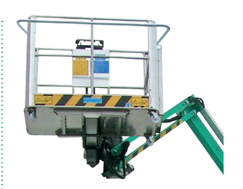
SUPERIOR ROTATION Outstanding accessibility with a 355° rotation (non-continuous) and 124° jib rotation