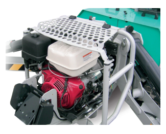
BI-ENERGY POWER A Honda Engine and Electric Motor provide a bi-energy solution, allowing both indoor and outdoor use (shown with a rugged engine guard for improved protection)