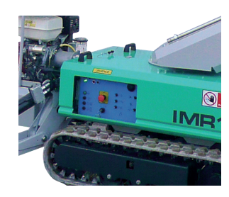
EASY ACCESS In addition to the removeable control box in the basket, the IM R Series includes an easy to access ground control panel.