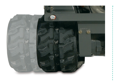
ADJUSTABLE TRACKS Hydraulically adjust the track width for added stability and traction, and to fit through narrow doorwatys and gates for interior or exterior projects