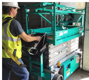
Narrow platforms and foldable guardrails allow for easy access through standard doorways