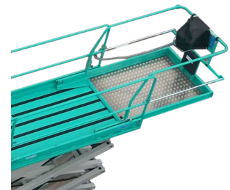
Manual deck extension of 39" 510 lb Capacity Number of Occupants - 2