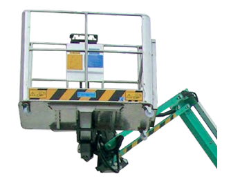
SUPERIOR ROTATION Outstanding accessibility with a 355° rotation (non-continuous) and 124° jib rotation