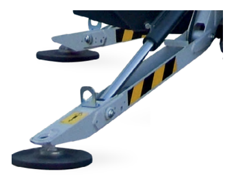
FAST & SECURE LEVELING Automatic outrigger leveling system for quick set up and peace of mind.