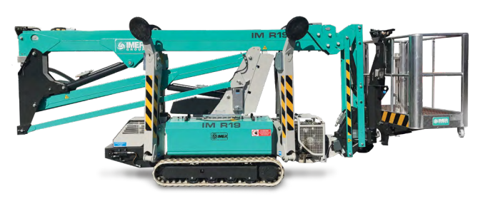
Easy access both outdoor and indoor. Non-marking tracks for indoor use