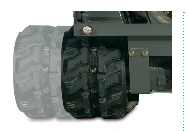
ADJUSTABLE TRACKS Hydraulically adjust the track width for added stability and traction, and to fit through narrow doorwatys and gates for interior or exterior projects