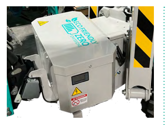
LITHIUM POWER Lithium batteries and AC electric motor for ultra-high performance